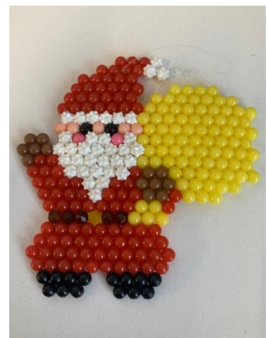
Key Stage 2

Well done to Saint who were the over winners of the competition, the full results can be seen below.