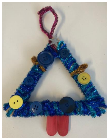
Key Stage 1